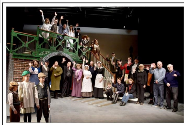
The whole cast and crew